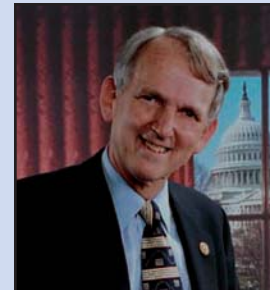
Connecticut Senator Christopher Dodd (D-CT), Connecticut Senator Joseph Lieberman (D-CT), Connecticut Congressman Christopher Shays (R-4) and Connecticut Congressman Robert Simmons (R-2)