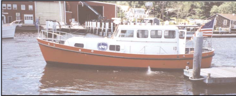
The ARCTIC SCOUT is being restored by Pilots Point Marina in Westbrook, CT