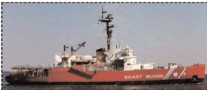
Photo shows the USS/USCGC GLACIER, built by the Ingalls Shipbuilding Corp., Pascagoula, MI, launched Aug. 27, 1954, and commissioned May 27, 1955. Considered a prototype in icebreaker construction, she was the free world's largest and most powerful icebreaker, capable of breaking ice up to 20 feet thick. Navy service extended to June 30, 1966 when she was transferred to the Coast Guard, serving until decommissioning in May 1987.