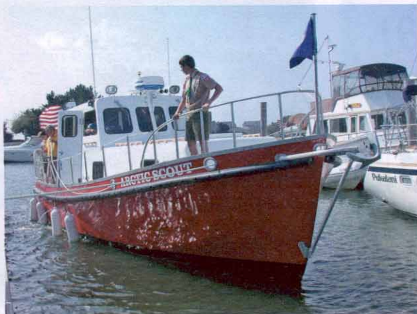
After a christening ceremony that bestowed the name Arctic Scout, the former Coast Guard workboat was taken out for a shakedown cruise.